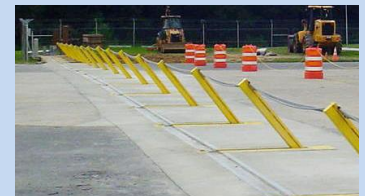
Electric Cable Trap.

Drives: hydraulic, pneumatic, electric (including battery), friction / gravity-drive, manual