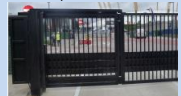
Bi-Folding Speed Gate.