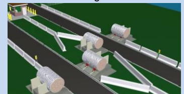
Semi-manual Barrier.