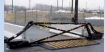
Mobile Net Barrier.