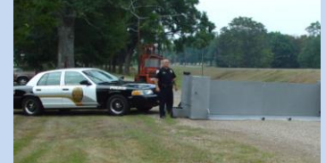
Portable Wedge.